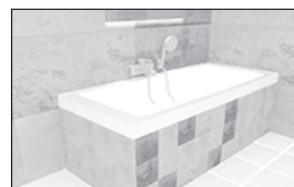
P. Black C

Max 2 Pantone separations should be used in the images.